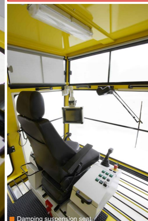
Damping suspension seat